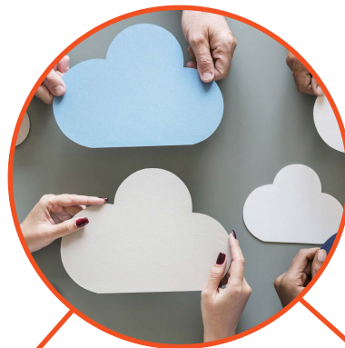
Results transmitted to cloud